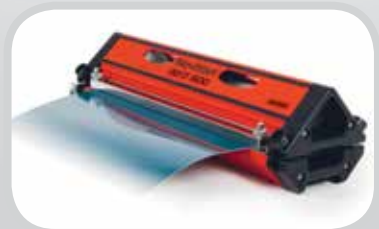
Novitool® Belt Fabrication Tools