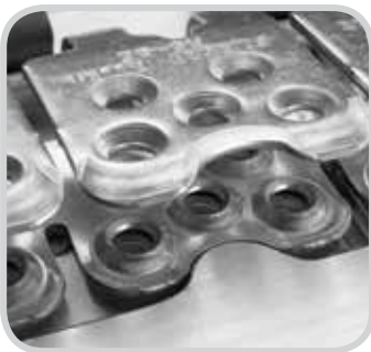
Fast, accurate positioning of fastener strips.