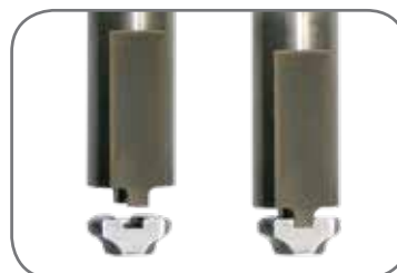
Exclusive to Flexco