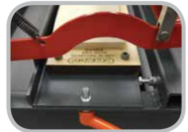
Easy positioning and clamping

2525 Wisconsin Avenue • Downers Grove, IL 60515-4200 • USA Tel: (630) 971-0150 • Fax: (630) 971-1180 • E-mail: info@flexco.com