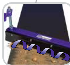
Quickly and efficiently the leading edge lifts and 'spirals' debris and water off the belt