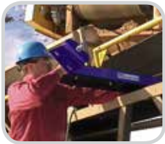
Simple and quick installation and blade replacement

The Diagonal Plough cleans the belt in front of the tail pulley. It keeps lumps, rocks and other fugitive materials out of the tail pulley where they could cause damage to the belt, the mechanical splice, the lagging or the pulley. This is the versatile, economical solution for protecting the tail pulley, drive pulley, or gravity take-up pulleys from carryback materials.