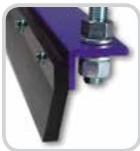
Innovative design cleans the belt quickly and provides a long wear life