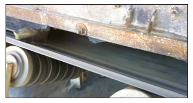
One of the most important jobs of the load point is to provide a seal that prevents material spillage and controls dust. In this photo, spillage and dust are likely because a proper seal is not attained.

While idlers are often used, belt sag is a common problem. The use of idlers can create air gaps between the belt and the skirting, allowing material to escape. This often makes sealing the load quite difficult and should not be solved by placing the idlers next to each other. The practice of putting idlers in close proximity to prevent sagging is impractical from a maintenance standpoint because access to the rolls for replacement is nearly impossible, especially with a skirt wall above the belt.