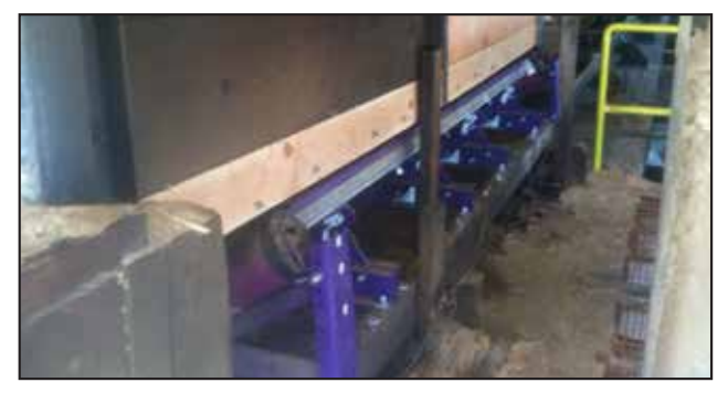
To seal the load zone properly, the clamping mechanism should be both durable and provide a strong hold. Paired with a belt support system that provides an even and consistent surface, a proper seal is achieved.

One of the most important jobs of the load point is to provide a seal that prevents material spillage and controls dust. The clamping mechanism should be both durable and provide a strong hold that discourages vibration and drag on the skirt rubber. It should also be easy to service the skirt clamp by providing a simple release mechanism on the clamp. A simple process to loosen the clamp allows for quick adjustment when the skirting material wears or skirting needs to be replaced. If the process is more complicated than this, maintenance may take too long or it may not be done at all.